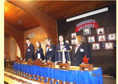
2010 WV TSA State Conference Cedar Lakes, Ripley, WV

The WV TSA Spring Conference provides competition in more than 25 events, a campaign and election of state officers, workshops and interest sessions, a formal banquet, and a variety of social events.