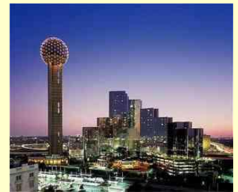
Dallas, Texas Skyline

TSA National Conference is the climax of the TSA year. All state associations gather to compete in the highest level of competitive events and to elect the new national officer team. Special interest sessions and keynote speakers highlight the conference activities.