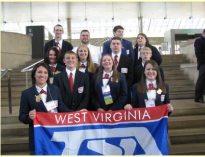
2010 WV TSA Officers at TSA National Conference